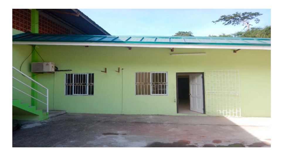
Renovated MNIB Pack House restroom facilities