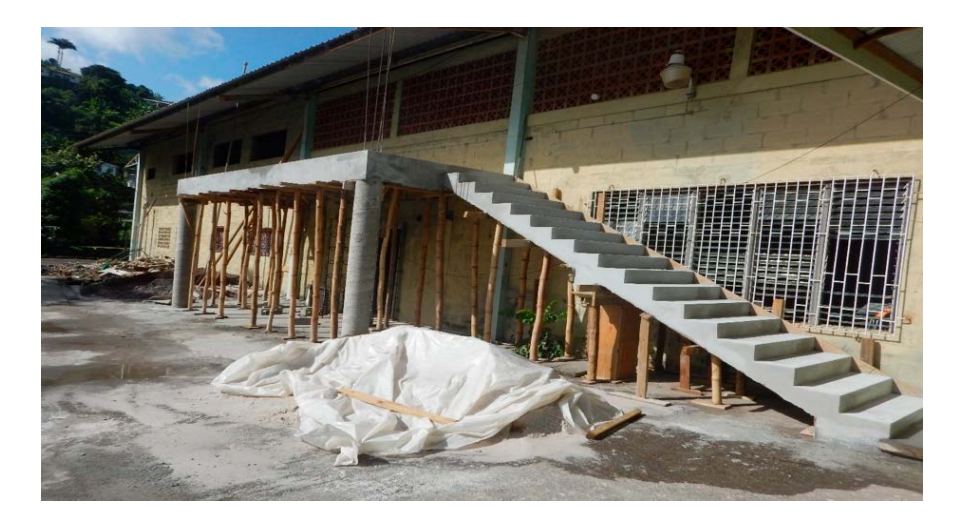
Before and after views of the entrance to the MNIB Pack House during the renovation process

The MNIB has recently received approval for follow-up loan and grant funding from the Caribbean Development Bank to complete the implementation of its food safety system. The loan and grant will provide support for capacity building, legislative improvements, new equipment, and research into the possibility of using MNIB's Pack House as a central export consolidation facility.