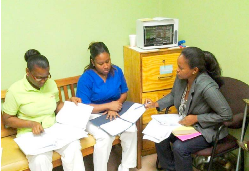
Coaching for St. Lucia Services Go Global workshop participants