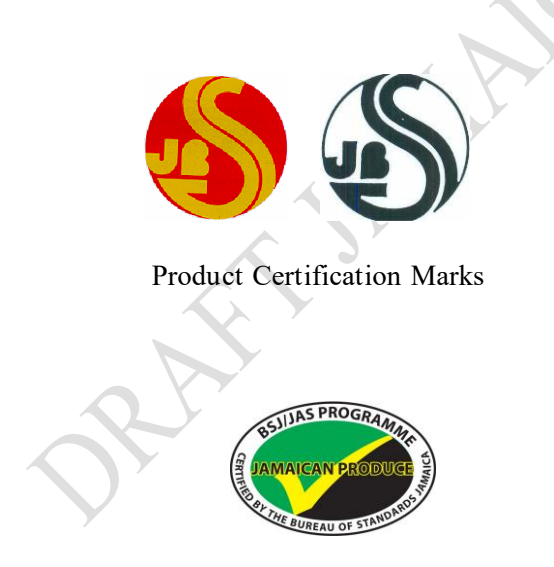
Certification of Agricultural Produce (CAP) Mark